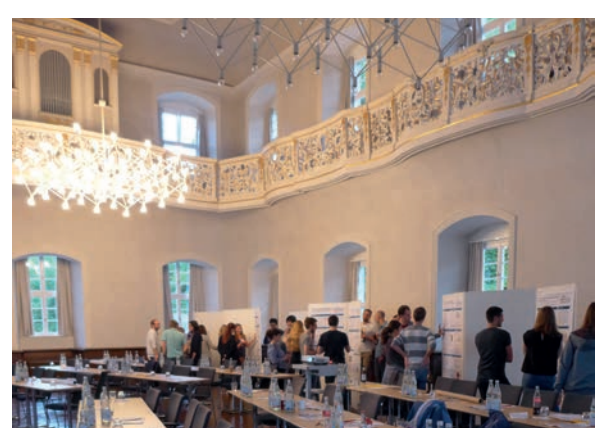
Lecture hall during poster session.

common lunch with each speaker for up to ten interested PhD students and young PostDocs to meet the speaker in an informal setting. While