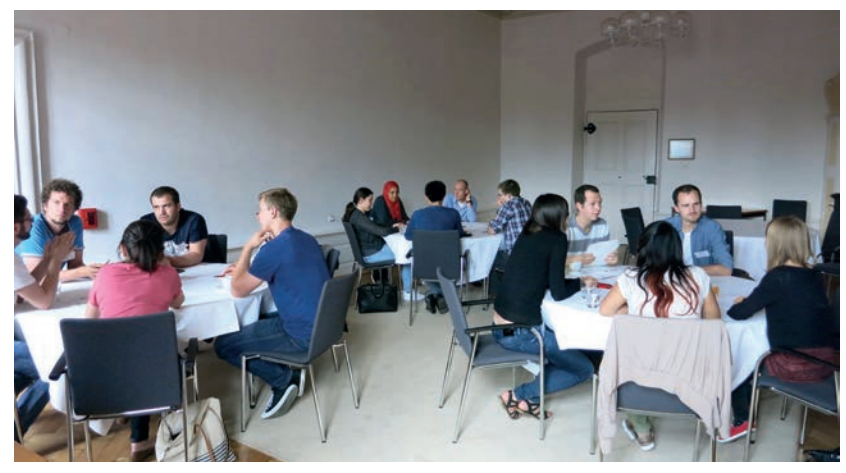
Round table discussions.

the meeting, one PhD student from each group introduces the main topics of their group and presents their work in front of an audience of about hundred scientists in a formal presentation. Additionally, three national and international guest speakers are invited to give a keynote lecture and to participate in the rest of the scientific activities during the meeting.