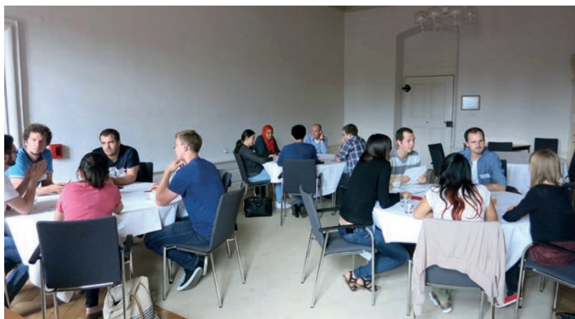
Round table discussions.

The BZH meeting serves the purpose of interconnecting the different groups of the BZH not only