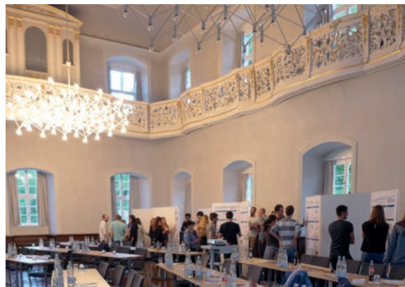
Lecture hall during poster session.

common lunch with each speaker for up to ten interested PhD students and young PostDocs to meet the speaker in an informal setting. While