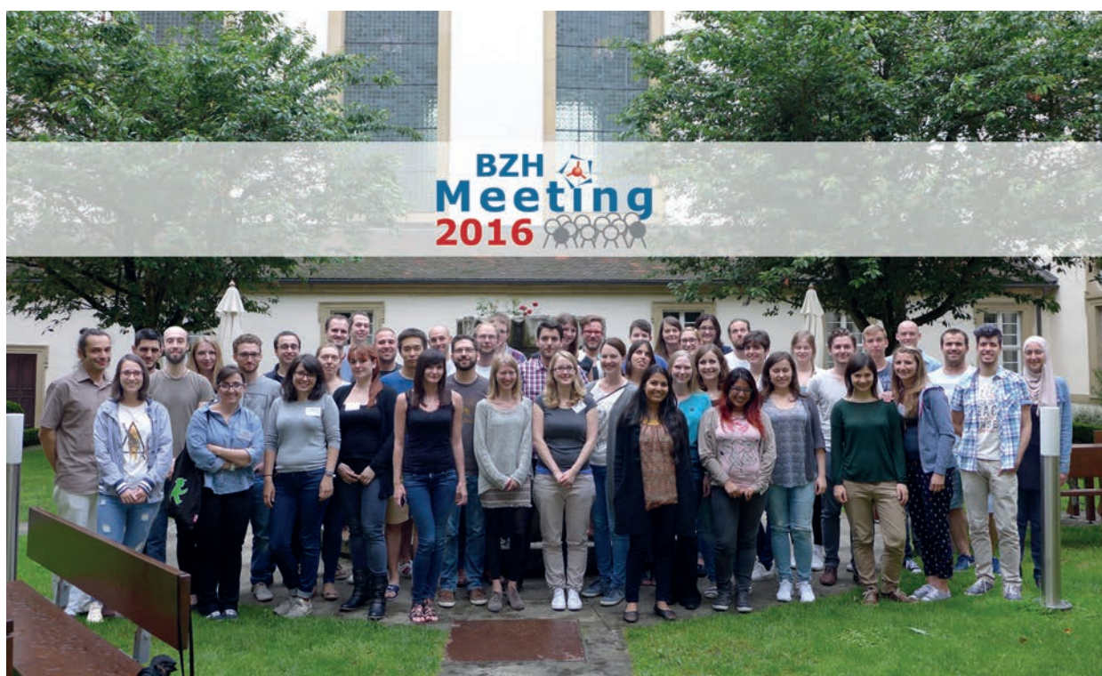
Group photo of the participants of the BZH Meeting 2016 at Kloster Schöntal..